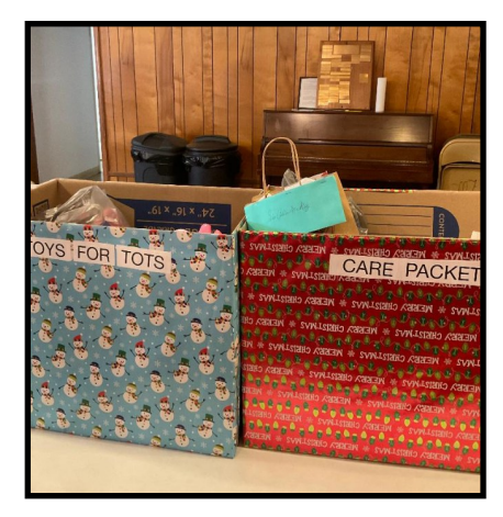
ZW Members donate to make Christmas brighter for others.