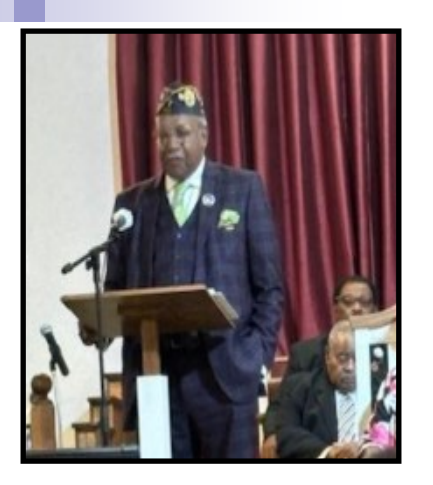
Veterans' Day 2024 at the Annual Conference